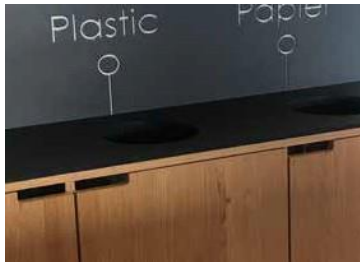
TOTAL WASTE MANAGEMENT

JPG Hulsebosch will have 1400m2 solar panels in April 2020.